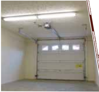
Full size garage

A spacious master bedroom with full bath and walk-in closet features special attention to ease of movement and use.